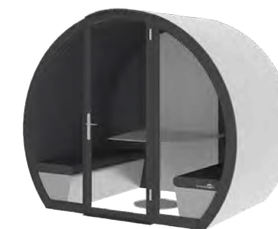
● Fully enclosed, acoustic back panel meeting pod