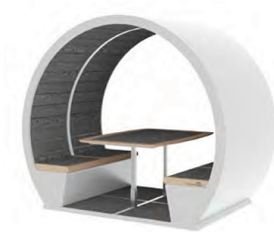
● Open outdoor pod

Our outdoor pods make use of underutilised outside space, providing a year-round place to work, meet or simply chill out. With sizes from 2 to 8 persons, be ready to change your working environment forever.