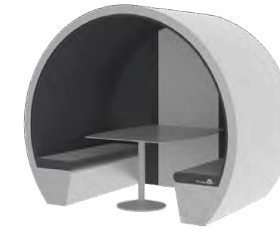
● Part enclosed, acoustic back panel meeting pod