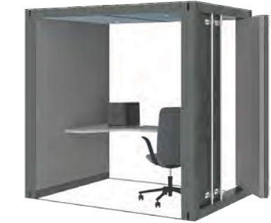
■ Private container office