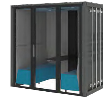
■ Fully enclosed container box