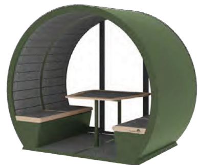
● Outdoor pod Change in shell colour