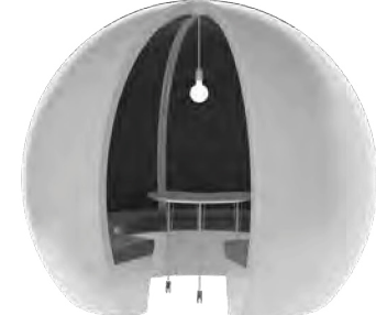
7 Person escape pod