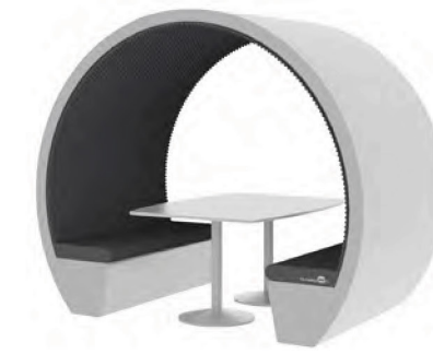
● Open meeting pod

With its stunning design, modular capability and full range of accessories, our meeting pods can deliver a collaborative working environment in any space.