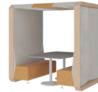
■ Open meeting box

With its clear linear design, which maximises space efficiency, the meeting box can be offered as an open, part enclosed or fully enclosed meeting space or private office