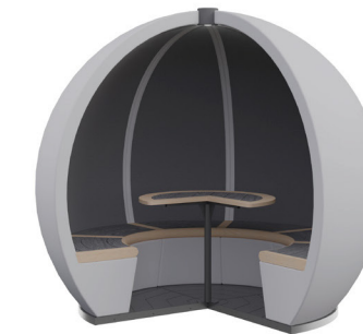
6 Person outdoor orb pod