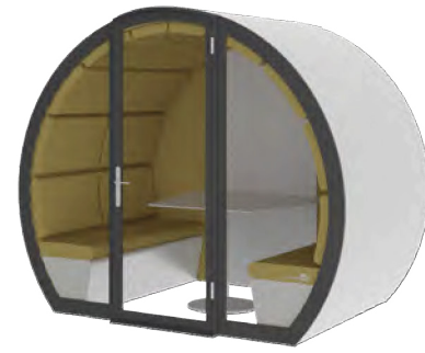
● Meeting pod Upgrade to bolstered foam & fabric seating