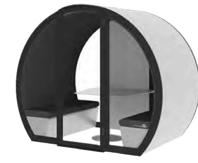
● Fully enclosed, glass back panel meeting pod