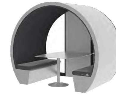
● Part enclosed, glass back panel meeting pod