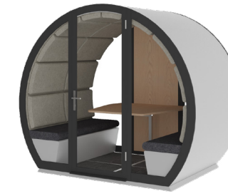
● Outdoor Office Pod