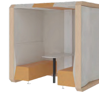
■ Part enclosed container box