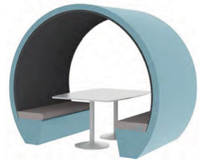
● Open pod Change in shell colour

We can create virtually any internal or external colour combination, material or specific branding requirement.