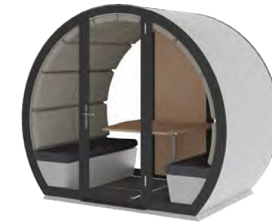
● Fully enclosed outdoor pod