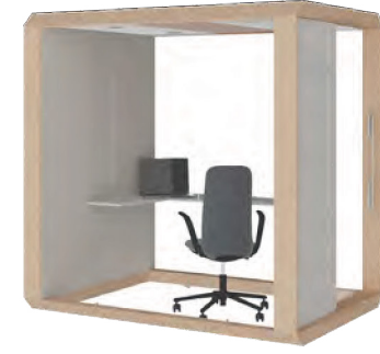
■ Private meeting office