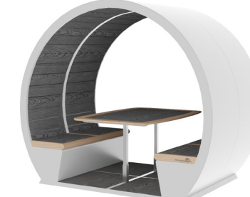
● Outdoor Pod