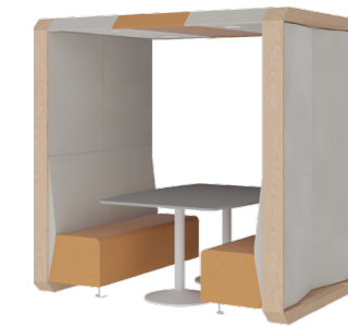
● Meeting Box