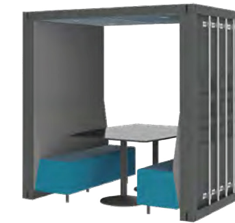
■ Open container box

The container box introduces an industrial theme to your workplace, making it a truly outstanding feature within any office environment. Sharing its linear design, dimensions and layout options with our meeting box.