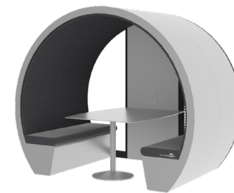
● Meeting Pod