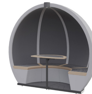
4 Person outdoor orb pod

Our outdoor orb pods make use of under-utilised outside space, providing a year-round place to meet up, take lunch or simply chill out. With sizes from 4 to 6 persons, be ready to change your working environment forever