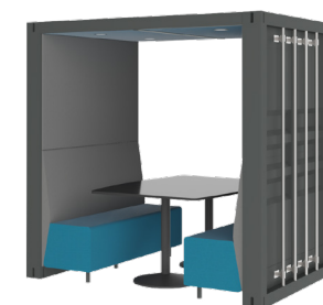
● Container Box