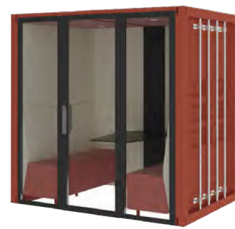
● Container box Change in shell colour & fabric colour