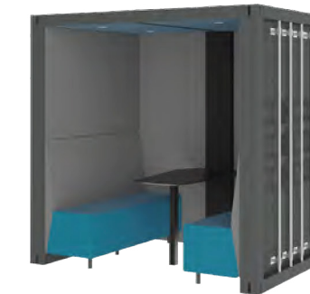
■ Part enclosed container box