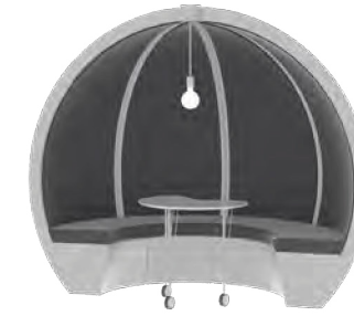
4 Person escape pod

Sometimes we just need to get away from our desks, the escape pod provides the perfect tranquil environment to make that private call or recharge, ready for the next challenge.