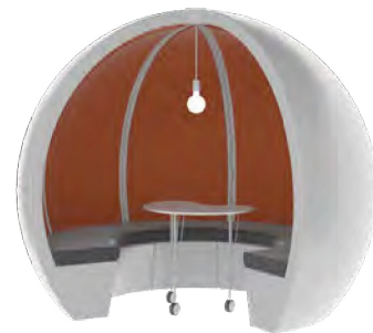
● Escape pod Change in foam colour