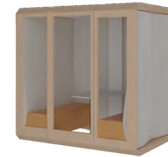
■ Fully enclosed meeting box