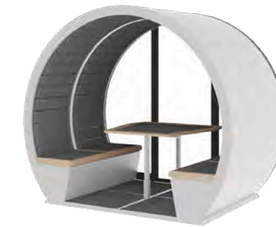
● Part enclosed outdoor pod