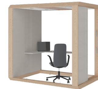
● Private Office