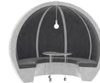
5 Person escape pod