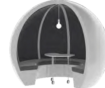
6 Person escape pod